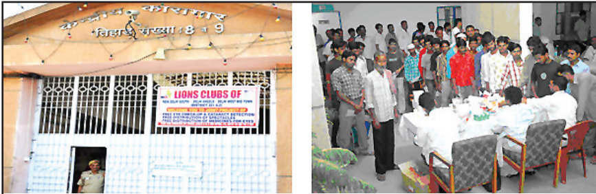
Figure 2: Denture Camp Is Also Organized By Various Ngo Affiliated To Tihar Jail.