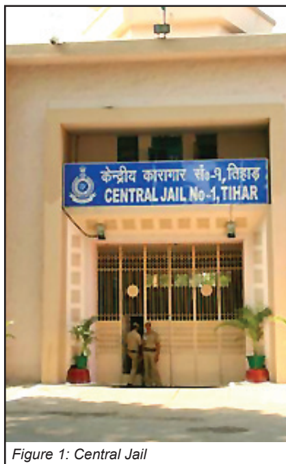
Figure 1: Central Jail

Civil Assistant Surgeon: He is the head of Dental Department. He is stationed in CJH & work under the Resident Medical Officer. This post is filled by the UPSC or on adhoc basic by the Health Ministry of Delhi Government.