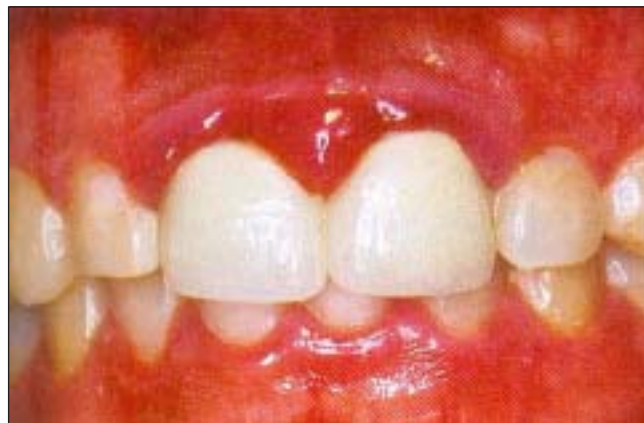
Fig. 1: The Biologic Width Concept

There is general agreement that placing restorative margins within the biologic width frequently leads to gingival